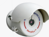
Protective Cover included with each new detector