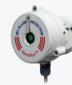
Tilt Mount included with each new detector