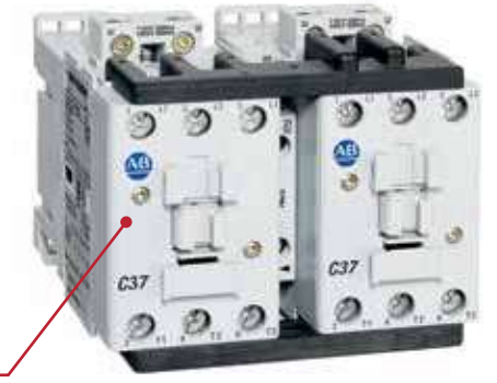
104-C Reversing IEC Contactor

24V DC coil reduces dropout time to 18-23ms