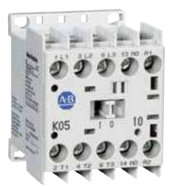
100-K IEC Contactor

The Bulletin 100-K miniature contactors are designed for commercial and light industrial applications where panel space is at a premium. These miniature devices, while 45 mm wide, are shallower and have less panel depth requirements than standard IEC contactors.